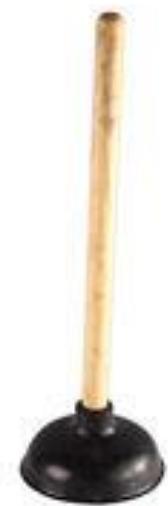
Simple harmonic oscillator